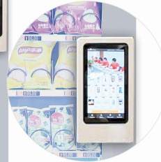
10.1 " Touch Screen